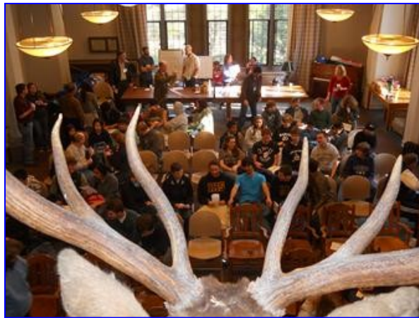
2011 Winner: Woodinville High School